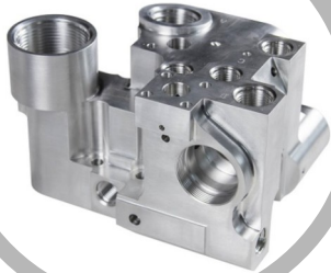
5 AXIS HIGH PRECISION ENGINEERING PARTS