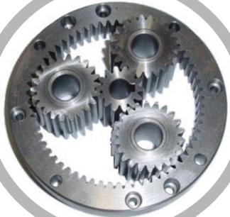
HIGH PRECISION GEAR SETS